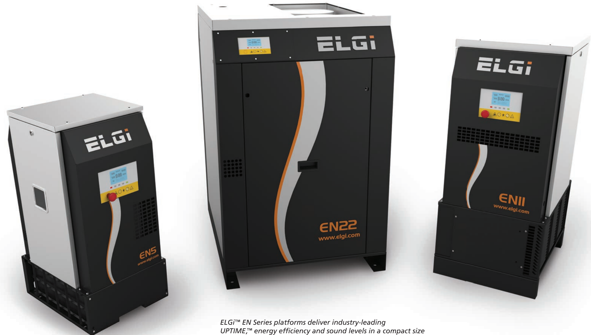
ELGi™ EN Series platforms deliver industry-leading UPTIME™, energy efficiency and sound levels in a compact size and full array of optional features.

The EN Series integrates major systems such as the air intake system, compression system and oil separation system into one robust, encapsulated system. This simplified design results in a leak-free, silent and energy saving system that keeps your business running smoothly, efficiently and profitably.